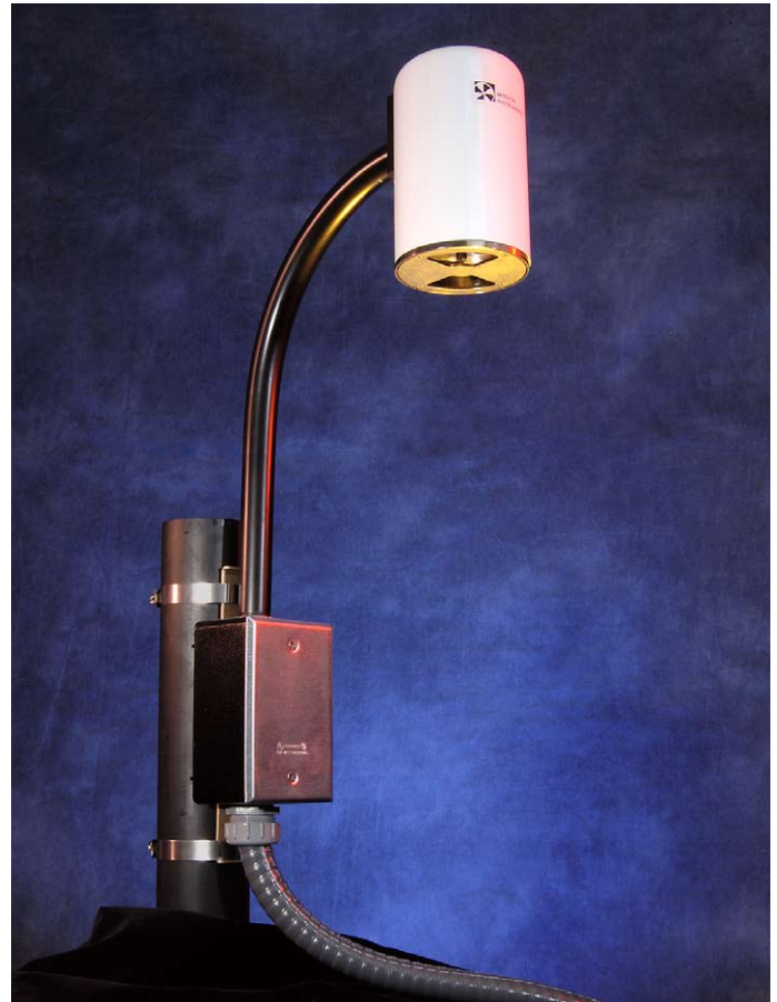
ZEBRA Field Mill